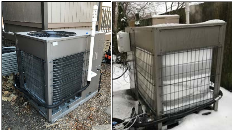
Figure 2: Pilot installations of the Next Gen GHP