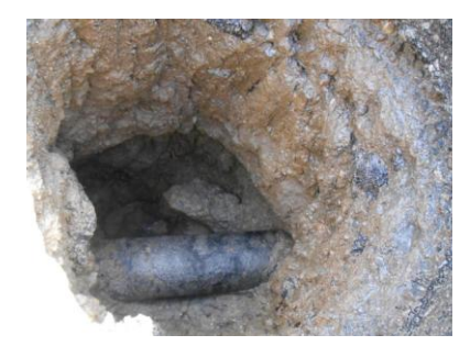
Exposed 6" steel water pipe