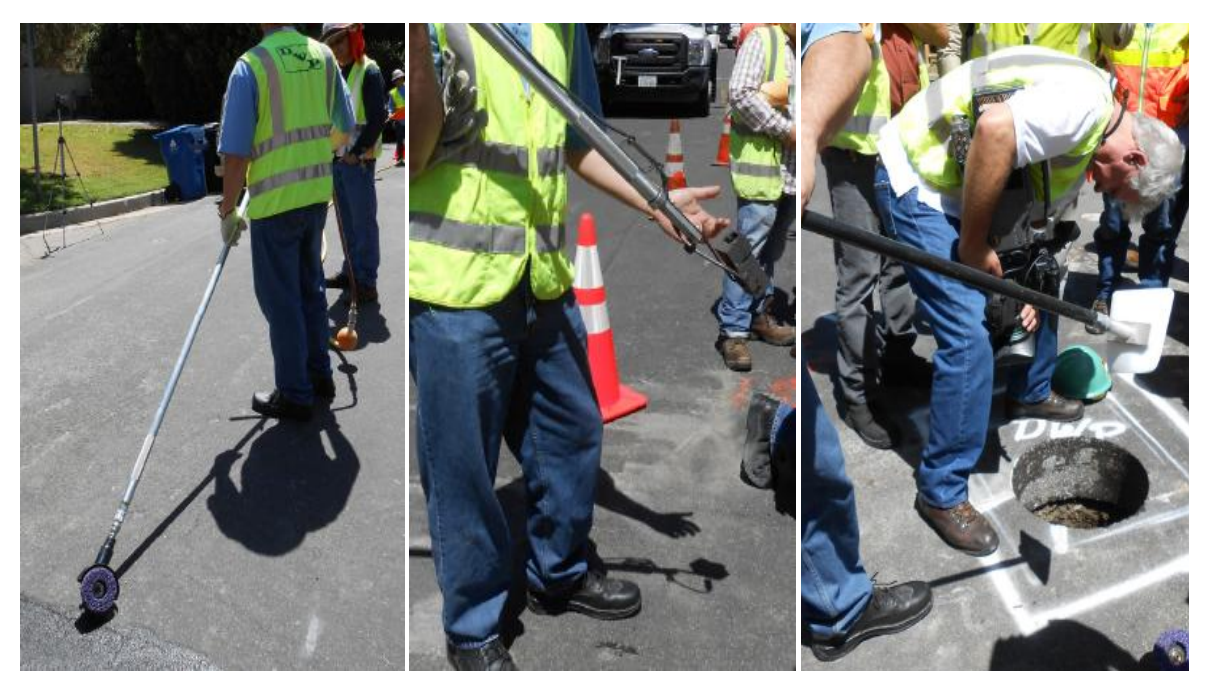
Long-handled tools used to grind away the pipe coating, cadweld the wire to the pipe, and re-coat the pipe and exposed wire