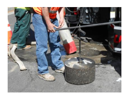
Extracting the 18" diameter core from the pavement