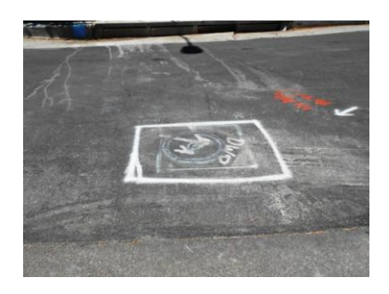
Restored pavement core open to traffic after 30 minutes