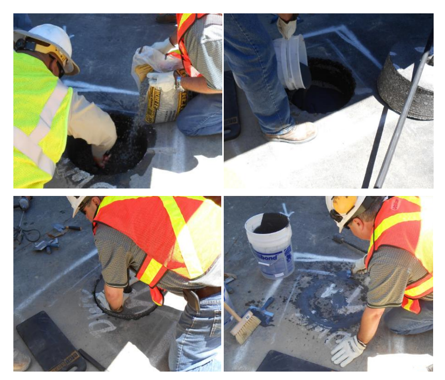
Replacing the pavement core for a permanent roadway restoration