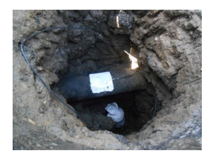
Anode installed in keyhole and coating replaced on pipe